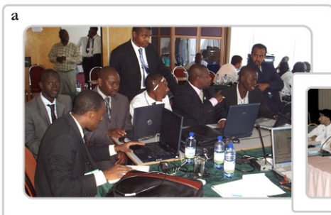
a. Africa - Data Validation Meeting (2007) b. Western Asia - Data Validation Meeting in Beirut, Lebanon (2006)