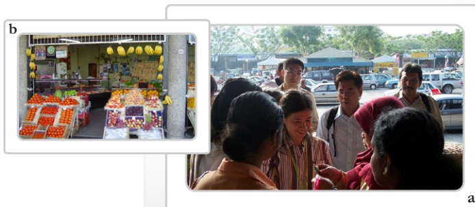
a. National Coordinators from 20 countries Visiting a Market in Kuala Lumpur, Malaysia b. A Sample Outlet used in Latin America