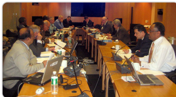
ICP Regional Coordinators meeting to discuss the preliminary results of the Ring Comparison (February 2007), Washington D.C.